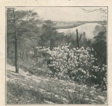
Beautiful Wild Flowers