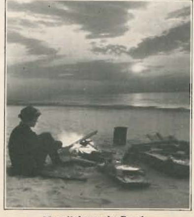
Moonlight on the Beach

Take along your lunch-or pick up a delicious box lunch, reasonably priced, at