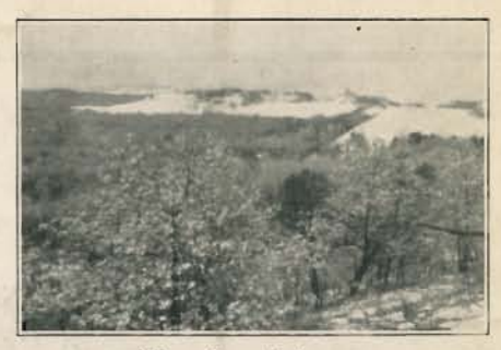
Like a Scene in Japan