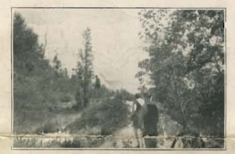
Where the Trail Leads Upward