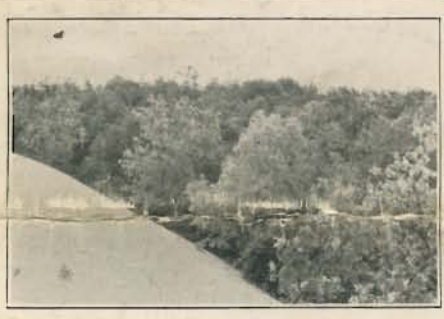
Shifting Dune Covering a Forest

Many of the dunes, swept by wind, are moving constantly. You can see where whole forests are being covered up and blotted out by these shifting dunes. At other places you can see, poking through the dune sides, the skeletons of huge trees that have been covered by the shifting sand and are again being uncovered by the moving hills. It's a most weird and fascinating sight!